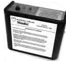
Series 750 Control Unit